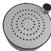
LS-Mic combination type LS-EM-R

A headset makes the LKS 25 a very professional and efficient window intercom system, with or without wires.